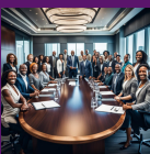
30 Industry Elite Subject Matter Expert Instructors & Consultants