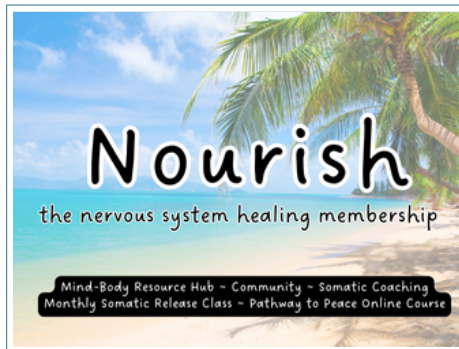
Nourish Healing Hub- Guided Videos/Audios + Monthly Classes $37