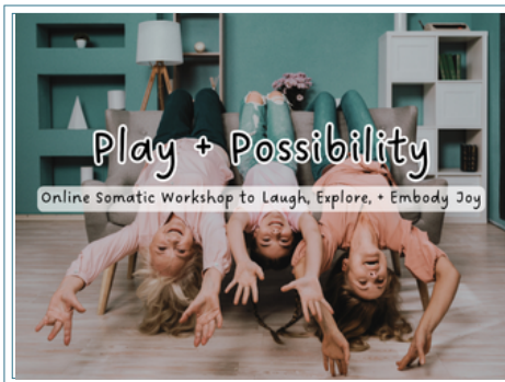
Monthly Play + Possibility Somatic Zoom Class $17

Click on the photo for more information!