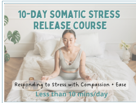
Less than 10 min/day- Somatic Stress Release Course $47