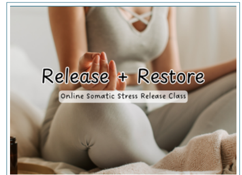
Monthly Release + Restore Somatic Release Zoom Class- $17