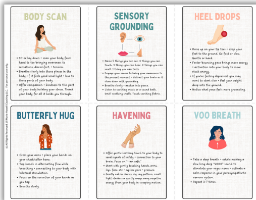
42 Printable Cards (Print + cut out!)